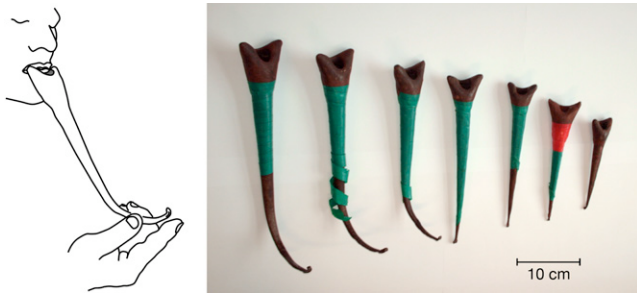
Figure 3. Mafa Flutes

The Mafa flutes consist of two functional components, a resonance body made out of forged iron and a mouthpiece crafted from a mixture of clay and wax. The flute is an open tube which is blown like a bottle, and has a small hole at its bottom end with which the degree to which the tube is opened or closed can be controlled. The depicted set of Mafa flutes is “refined” with a rubber band.